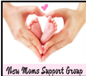
New Moms Support Group

welcome! The Reed of God Paperback – Illustrated, May 29, 2020 Next Meeting November 1 @ 5:15PM in the Social Hall Please bring a copy of the book.