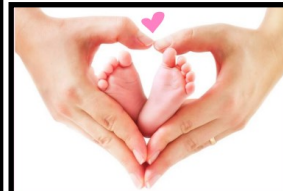
New Moms Support Group

Senior Lunch Wednesday, December 13 Following 12:15 -Mass Social Hall -We would like to invite the seniors of our parish to join us for lunch. Come reunite with old friends and make some new ones! Please RSVP to the office.