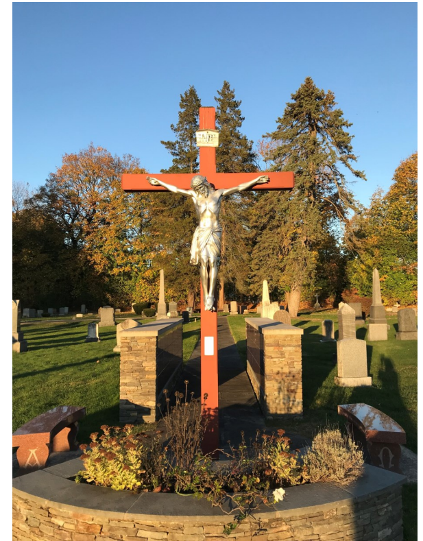
Crucifix at the Holy Innocents Columbaria